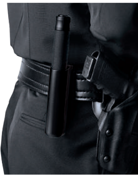
Envoy Scabbards are easily attached and rigidly secure.