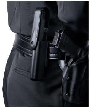
Revolution Scabbards are protective, secure and easily attached.