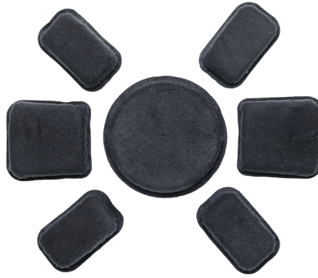
AIRESUPPORT SUSPENSION SYSTEM