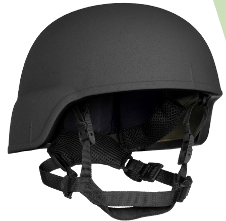
REGULAR-CUT / NO ACCESSORIES