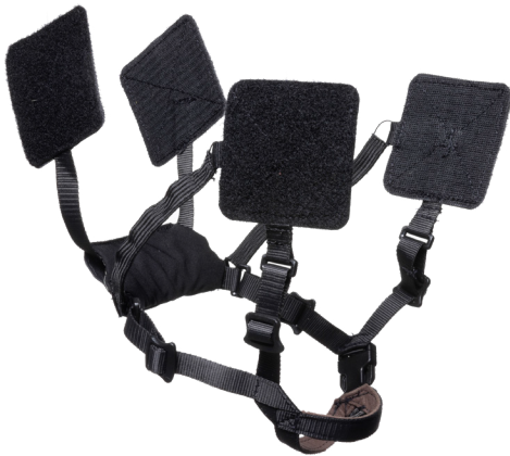
AIRELINK PLUS DIAL RETENTION SYSTEM