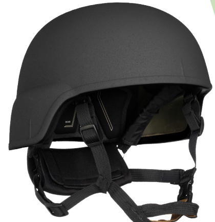
REGULAR-CUT / NO ACCESSORIES