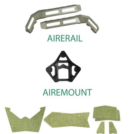
OPERATIONAL LOOP SYSTEM