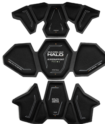
AIRESUPPORT PRIME SUSPENSION SYSTEM