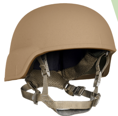
REGULAR-CUT / NO ACCESSORIES